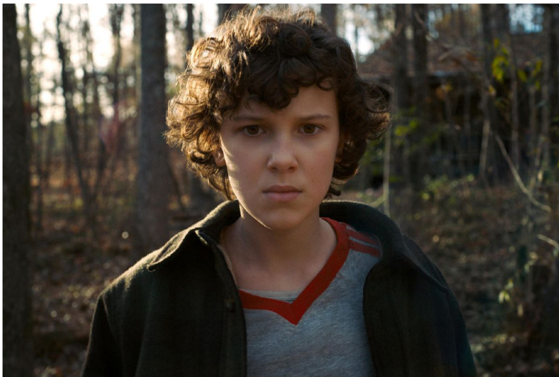
Millie Bobby Brown as Eleven in Season 2 of Stranger Things.

For Mike (Finn Wolfhard), it's been a tough Halloween. Not only were he and his pals the only kids to wear costumes to school — “How does everyone but us know?” Dustin (Gaten Matarazzo) asks, speaking for every kid, ever — but Dustin and Lucas (Caleb McLaughlin) ruined trick-or-treat by including a new girl.