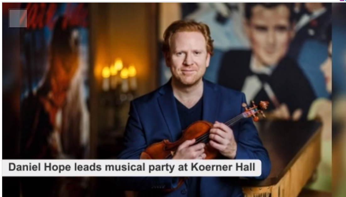
Daniel Hope leads musical party at Koerner Hall

Copyright owned or licensed by Toronto Star Newspapers Limited. All rights reserved. Reproduction or distribution of this content is expressly prohibited without the prior written consent of Toronto Star Newspapers Limited and/or its licensors. To order copies of Toronto Star articles, please go to: www.TorontoStarReprints.com